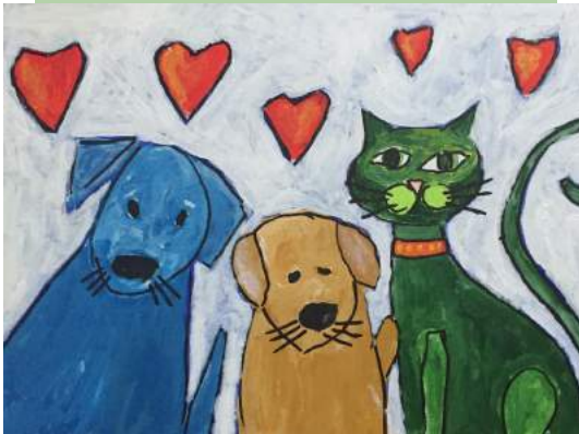
Brews and Brushes coming in May! Check our schedule online for more details.

Thank you so much in advance for your generous donations!