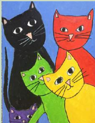
"Five Cats" Brews and Brushes coming in June! Check our online schedule for more information.

Thank you so much in advance for your generous donations!